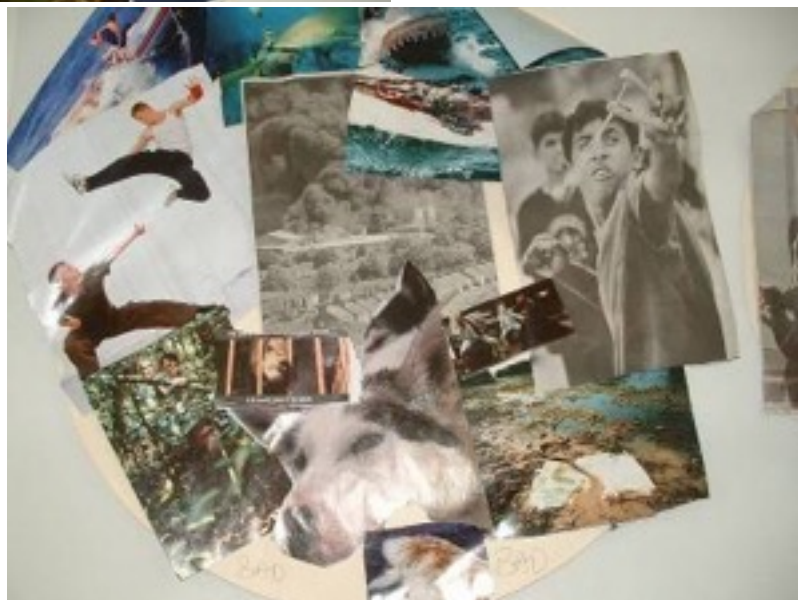
Children’s ideas of what can be found in a ‘bad world’