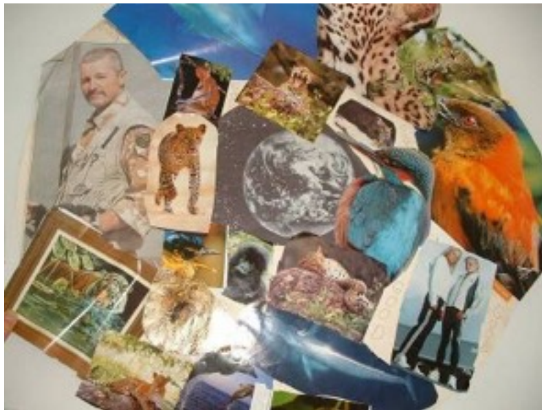
Children’s ideas of what can be found in a ‘good world’

OPENING GROUP ACTIVITY: Draw two circles on large pieces of paper (e.g. lining paper). Using old magazines & newspapers or drawing with coloured pens make a good world and a bad world collage (see the examples below). On the ‘good world’ celebrate the colours, textures, shapes, forms and sheer imagination of God’s creation. On the ‘bad world’ put examples of how human activity is causing a global biodiversity crisis – deforestation, waste, pollution, consumerism, climate change etc.